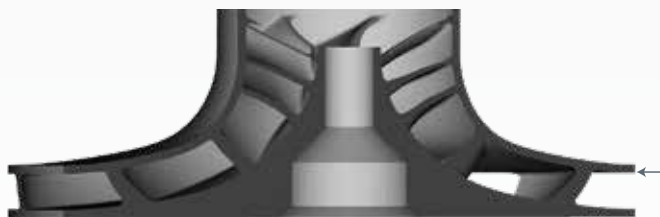
Zero degree overhangs

Print up to 4 units on a standard Sapphire ® build plate Print up to 12+ units on the Sapphire ® XC